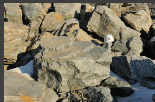
Heavy Stone Fill