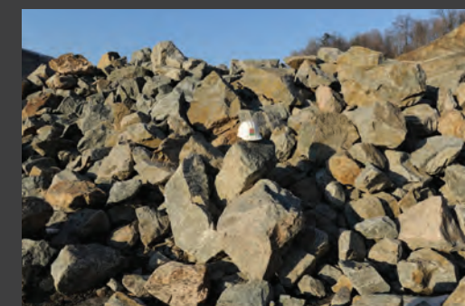
Medium Stone Fill