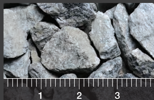
1 1/2" Aggregate

Asphalt plant makes all NYSDOT and FAA mixes.