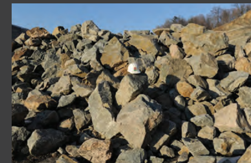
Medium Stone Fill