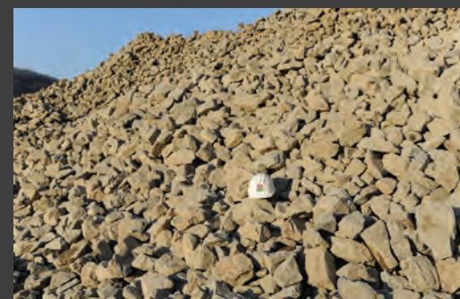
Light Stone Fill