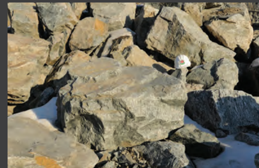
Heavy Stone Fill