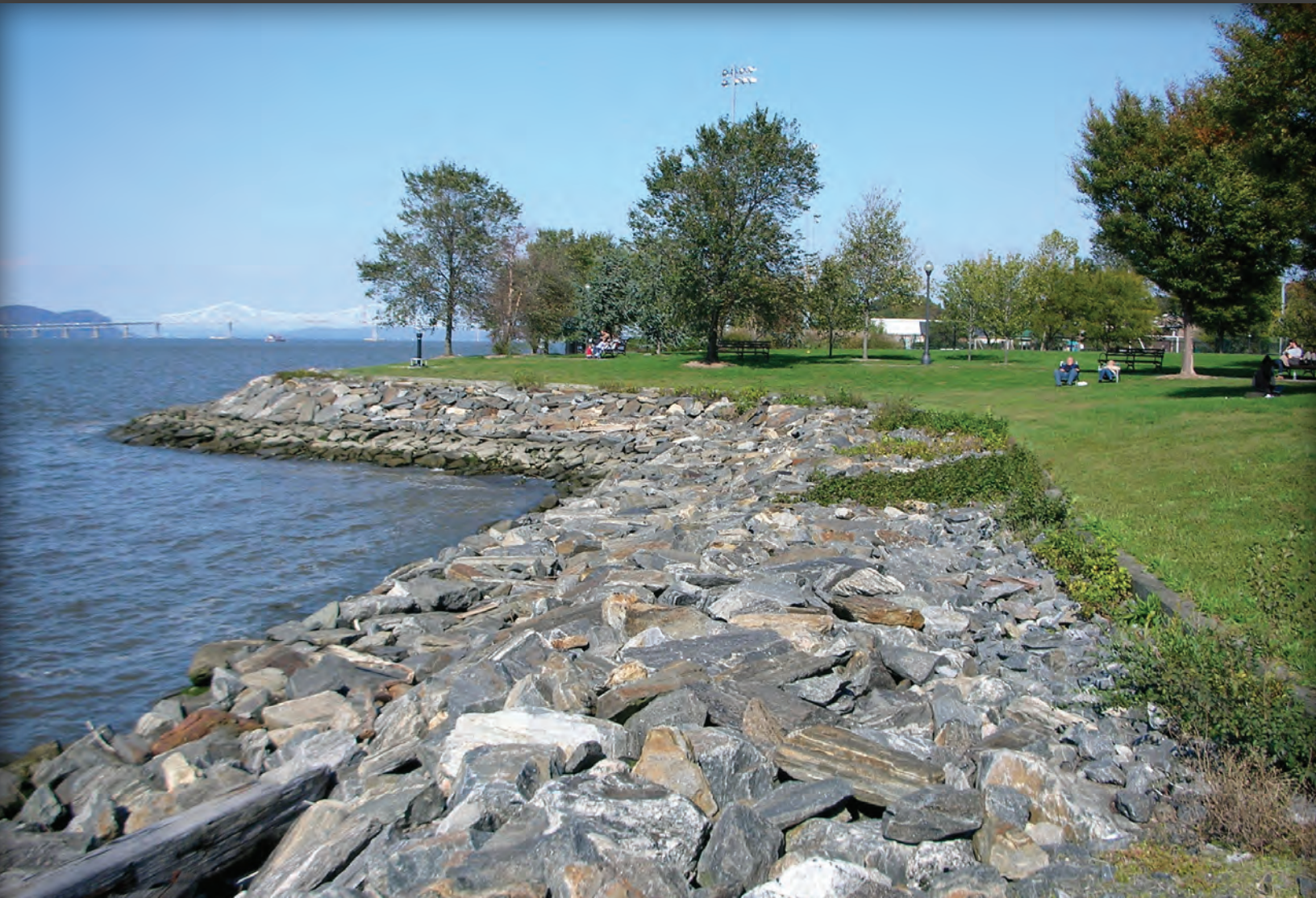
Scenic Hudson Park - Irvington, NY