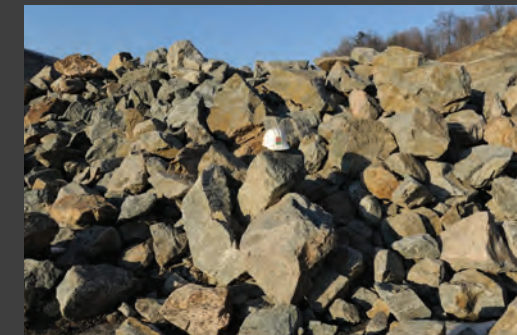
Medium Stone Fill