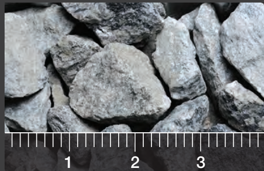
1 1/2" Aggregate