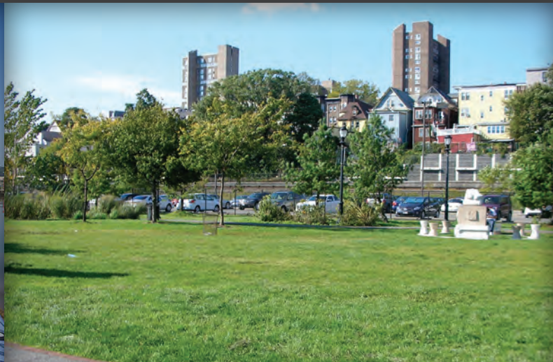
Esplanade Park - Yonkers, NY