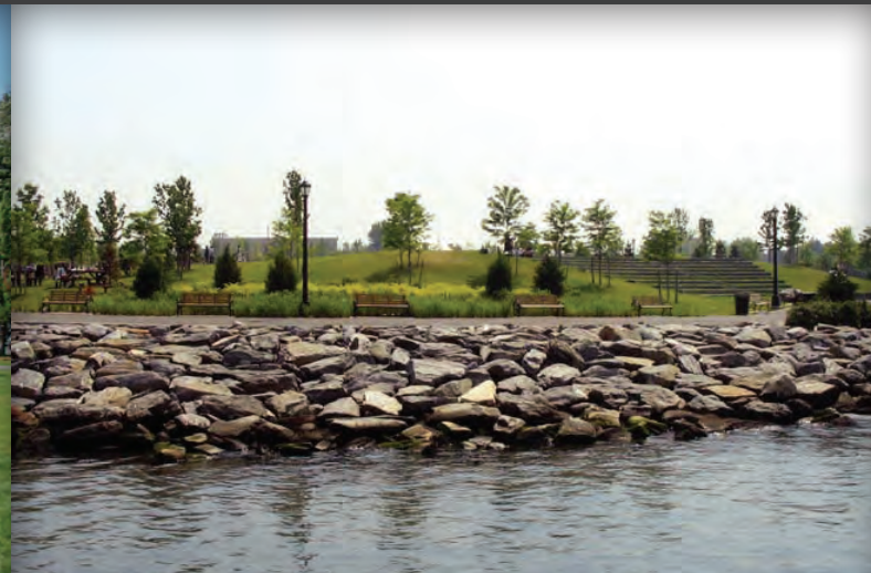
Barretto Point Park - Bronx, NY